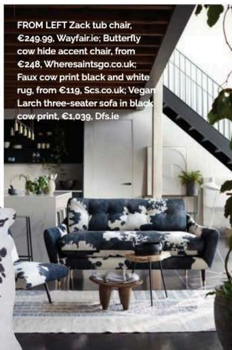
FROM LEFT Zack tub chair, €249.99, Wayfair.ie; Butterfly cow hide accent chair, from €248, Wheresaintsgo.co.uk; Faux cow print black and white rug, from €119, Scs.co.uk; Vegan Larch three-seater sofa in black cow print, €1,039, Dfs.ie