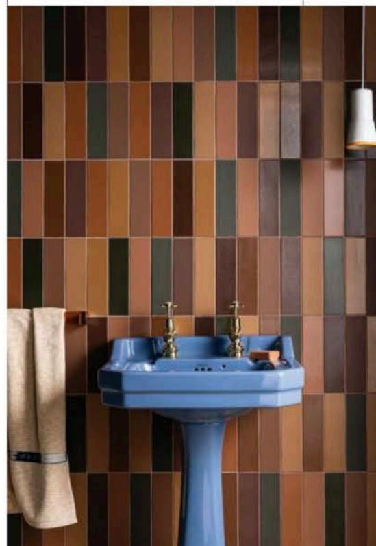
Soho Collection of brown porcelain tiles in matt and gloss, from €56.39, per sq m, Mandarinstone.com