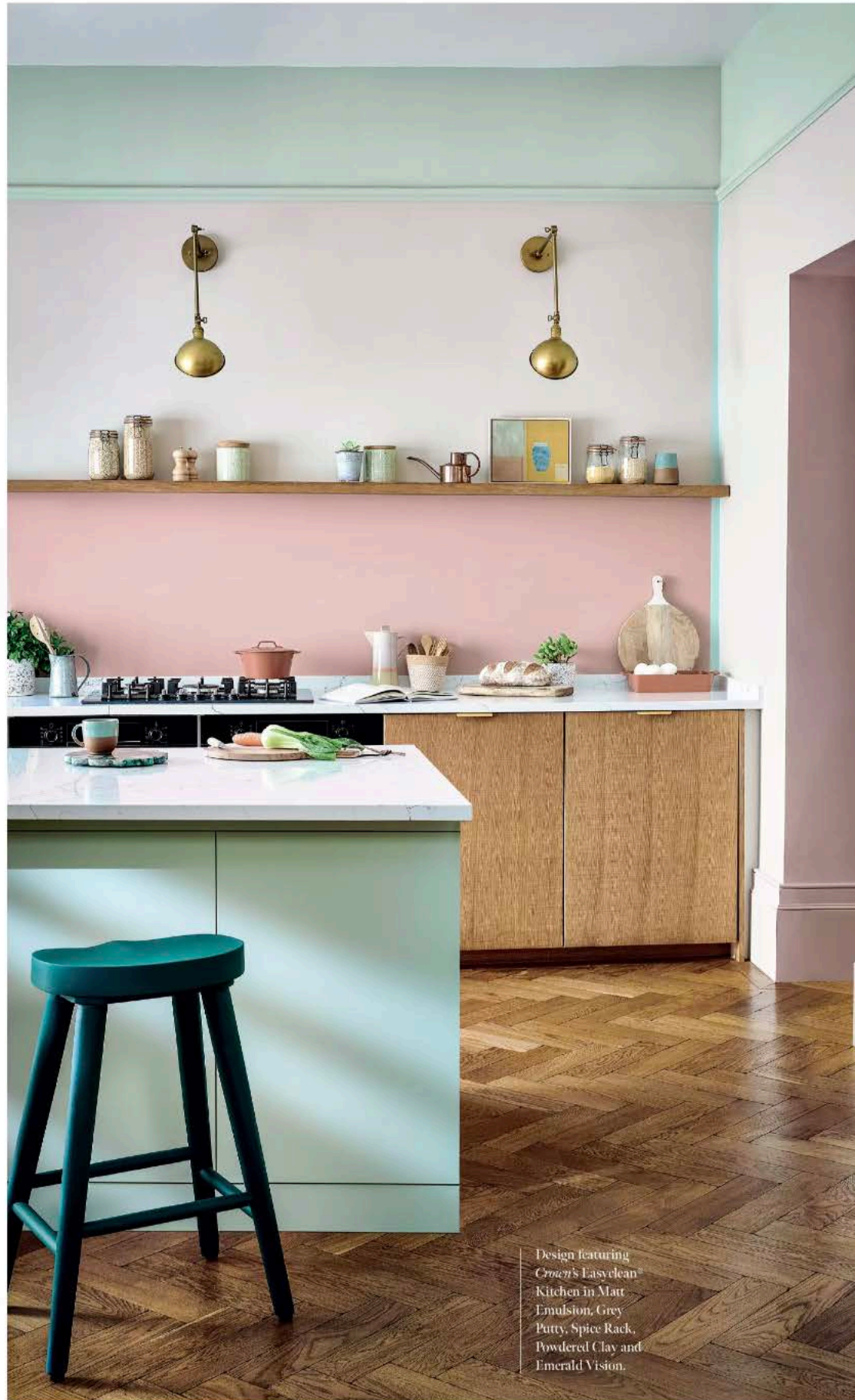
Design featuring Crown's EasyClean® Kitchen in Matt Emulsion, Grey Putty, Spice Rack, Powdered Clay and Emerald Vision.